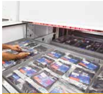
Alphanumeric LED Bar