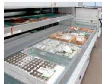
DUAL EXTERNAL DELIVERY