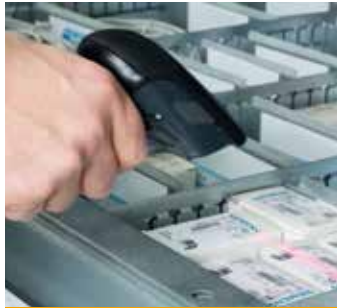
Bar Code Reader