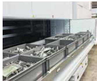
SINGLE EXTERNAL DELIVERY