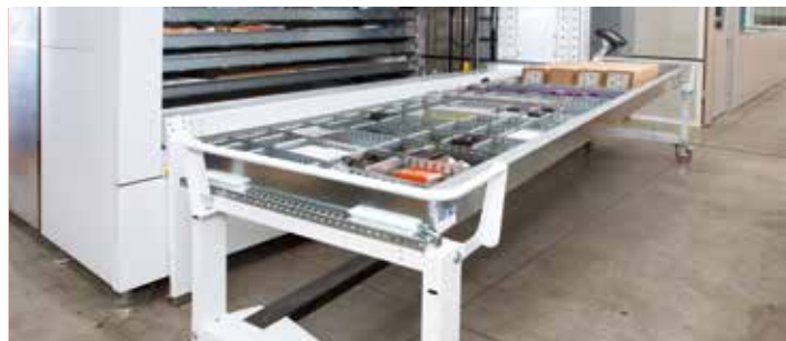
Cart for Tray Removal