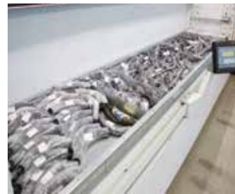
DUAL INTERNAL DELIVERY