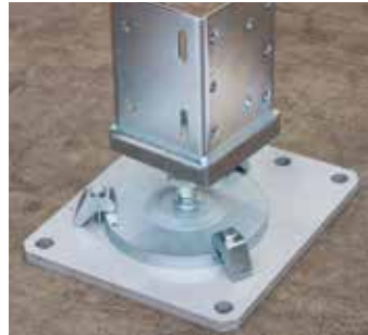
Weight Distribution Plates