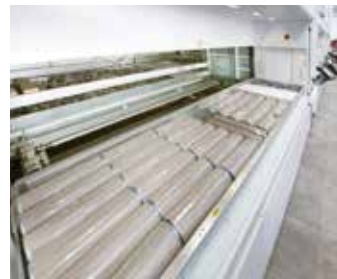
SINGLE INTERNAL DELIVERY

Dual delivery is the ideal configuration for a fast-paced picking operation.