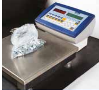
Piece Counting Scale